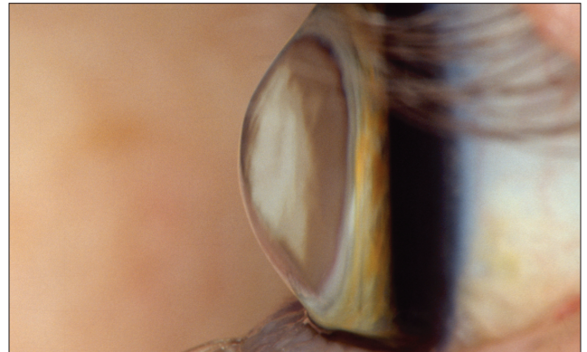
An eye with keratoconus.

The rate of progression varies. Keratoconus will often progress slowly for 10 to 20 years and then suddenly stop.